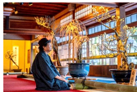
13th Photo Contest: Nagahama City Council Chairman's Award "Talking with Plum Blossoms"