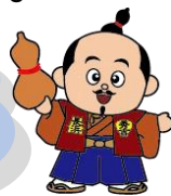
Hideyoshi-kun, Nagahama Tourism PR character

We aim to stimulate purchasing desire and expand consumption within the city, support local businesses affected by rising prices of energy, food, etc., and promote the revitalization and virtuous cycle of the local economy.